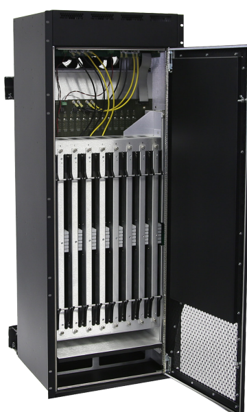
TLX640 Switch - Switch Cards