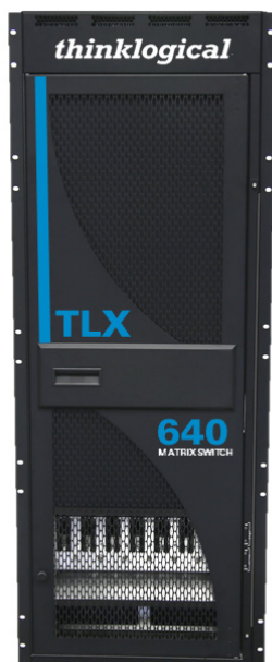
TLX640 Switch - Front

The TLX640 is a high performance, non-blocking matrix switch for complete, end-to-end routing of video and peripheral signals. The TLX640 is scalable in increments of 20 ports, up to 640 ports , for a unidirectional 640x640 or a bidirectional 320x320 switch.