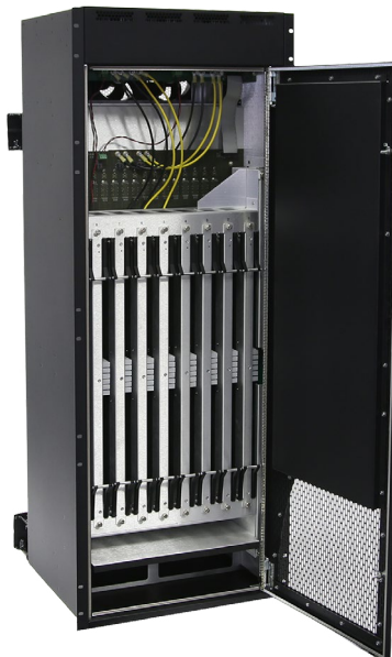
VX640 Router - Switch Cards