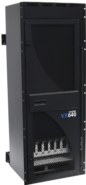
VX640 Router - Front

The VX640 is a high performance, non-blocking matrix switch for complete, end-to-end routing of video and peripheral signals. The VX640 is scalable in increments of 20 ports, up to 640 ports , for a unidirectional 640x640 or a bidirectional 320x320 switch.