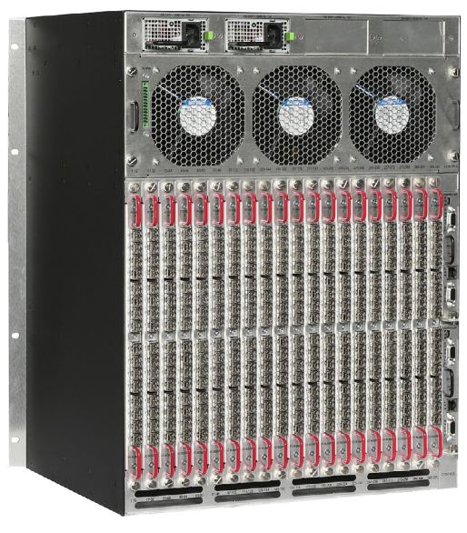
VXV320 Router · Front