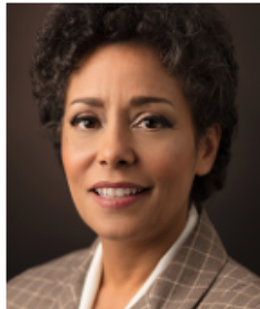
Michelle Howard Adm., USN (Ret.)

Can't join us live? Register to receive the recording when it's available!